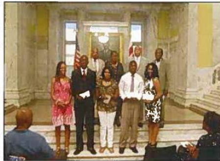
John A. Wilson Scholarship Program Scholarship Award Ceremony Washington, DC 2009