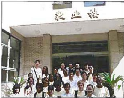
China Challenge Program Kong Jiang High School Shanghai, China 2009

Preparing District of Columbia High School Students For Tomorrow's Opportunities